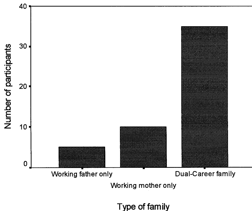
Figure 4.1 Number of participants with working fathers, working mothers or dual-career families.

The data also measured the relationship between the number of participants with working mothers in their lives and non-working mothers in their lives. Descriptive statistics show that 5 participants (10%) had a non-working mother within the household and 45 participants (90%) had a working mother within the household (see figure 4.2).