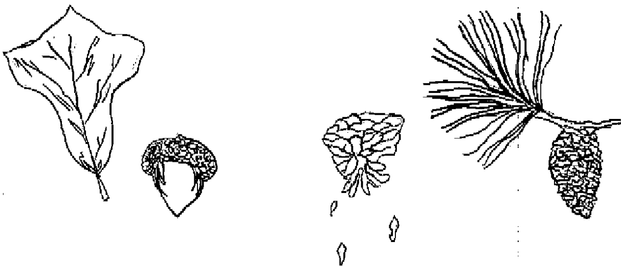
ACORN - ANGIOSPERM

Pine trees are gymnosperm. Gymnosperms have naked seeds, which means they are not enclosed in a fruit. For most gymnosperms, seeds are produced on female cones. Seeds inside pine cones are naked seeds, and they germinate best in loose fine soil.