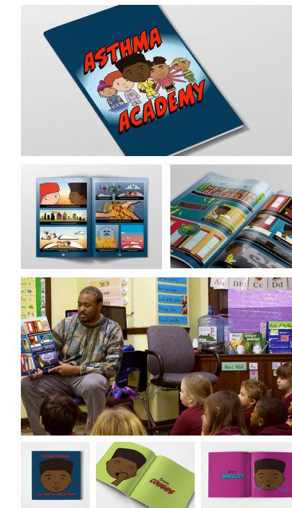
ASTHMA ACADEMY - Children & Asthma