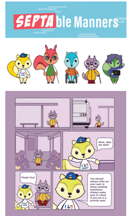
SEPTABLE MANNERS - Public Transportation & Manners