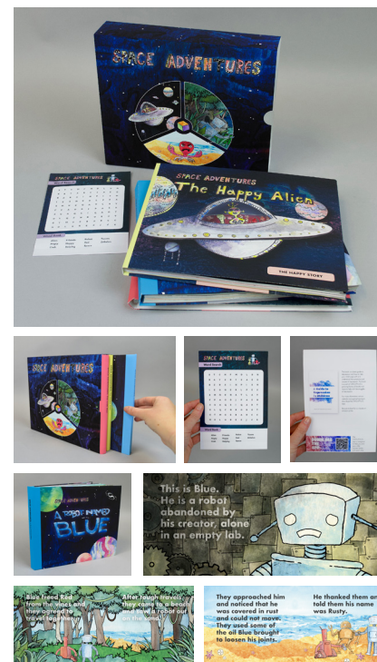
GROUPHUG - Children & Anxiety/Depression