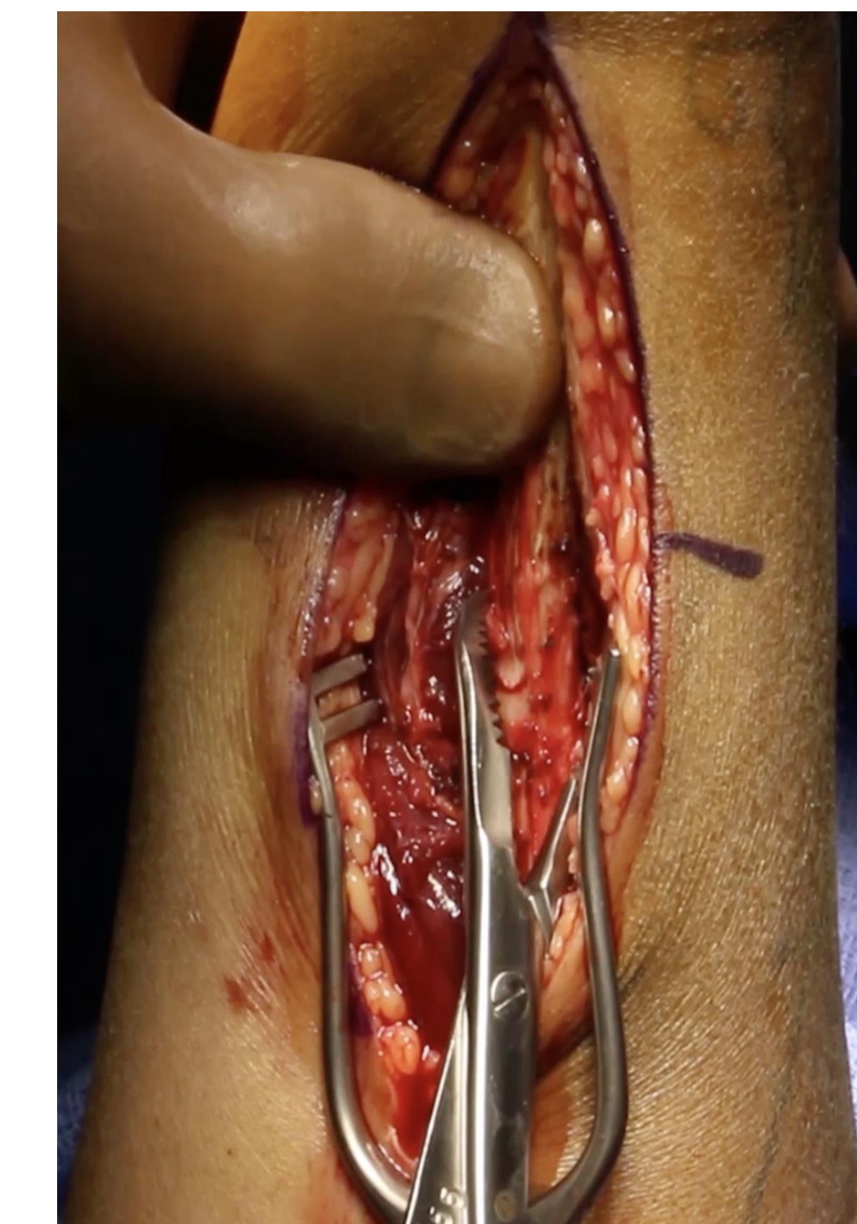
Fig 3: Anatomic reduction