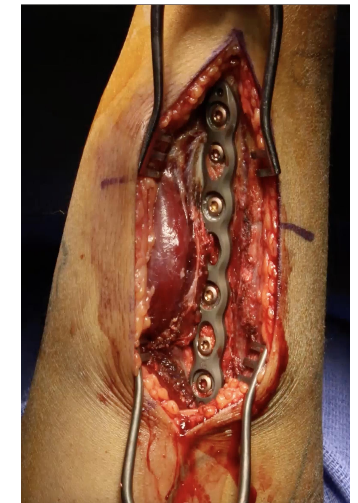
Fig 4: Plate fixation