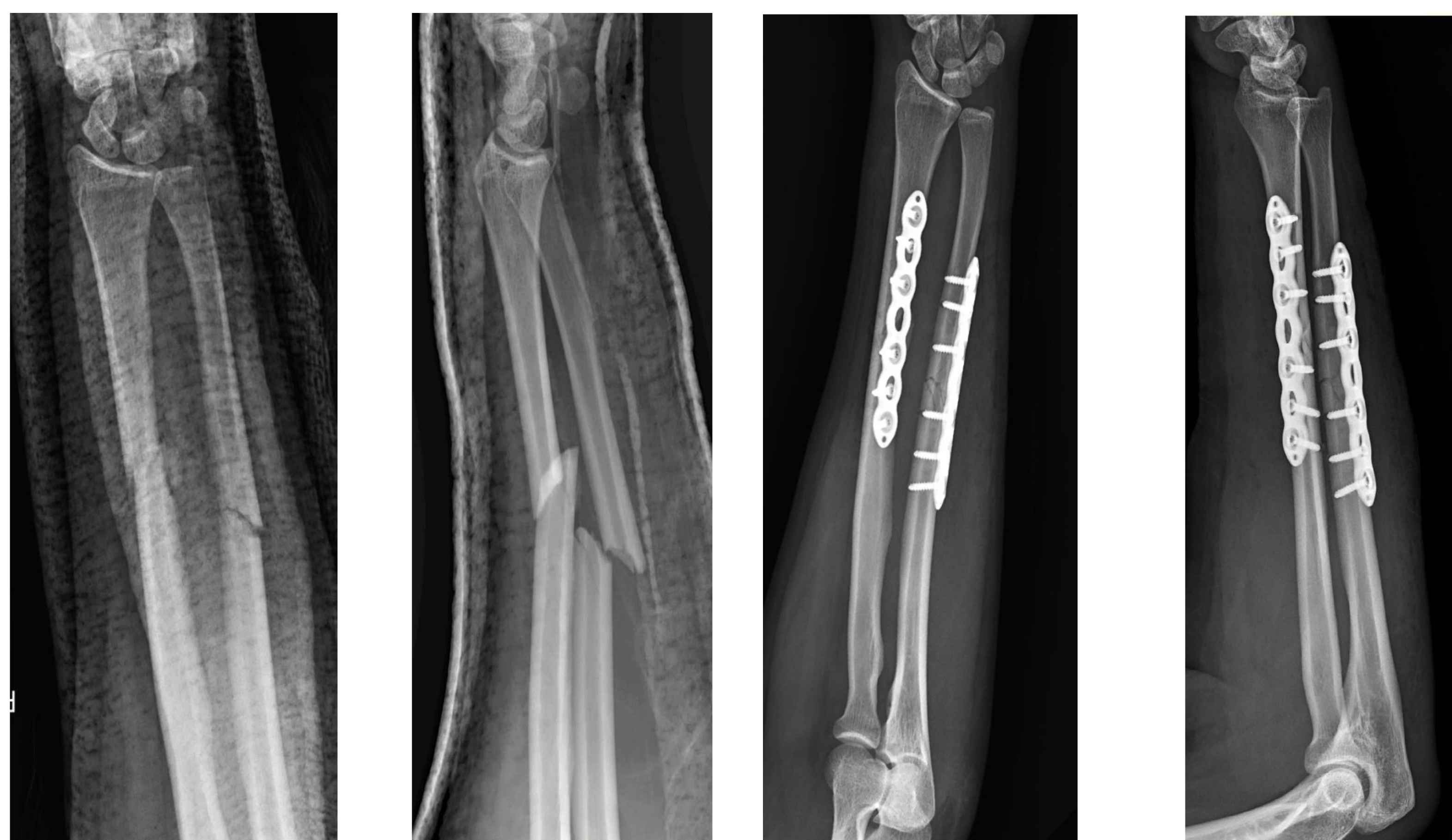
Fig 1: Pre-operative closed reduction X-Ray films

Can we film and produce high-quality educational video content for learners within the orthopaedic community?