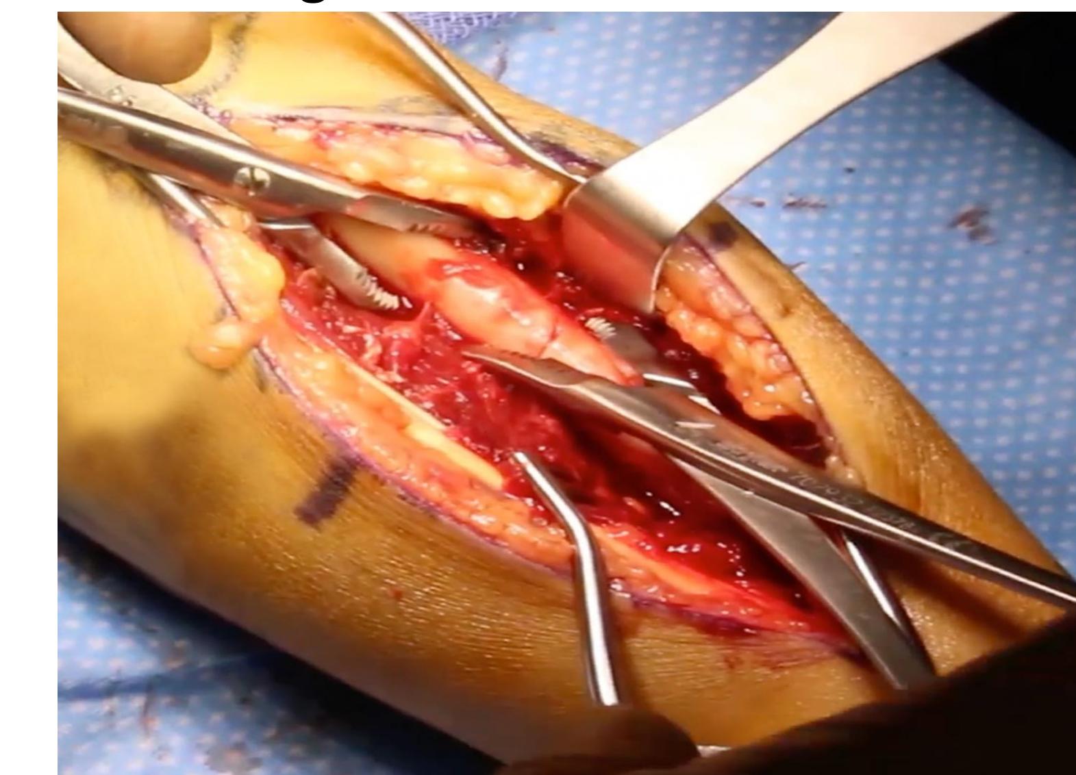
Fig 5: Anatomic reduction