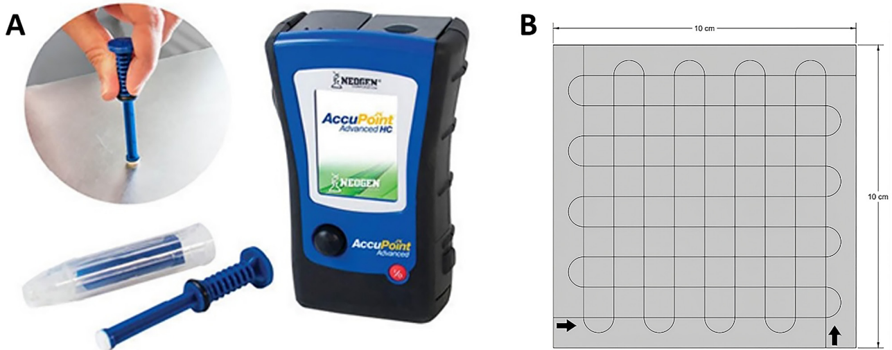
Figure 2: AccuPoint Advanced HC system with sampler (A) and zigzag swabbing technique for swabbing location A and location B (B).